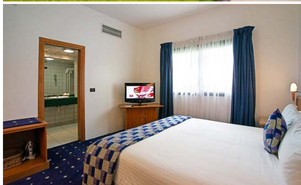
Front view of Fiesta Royale Hotel