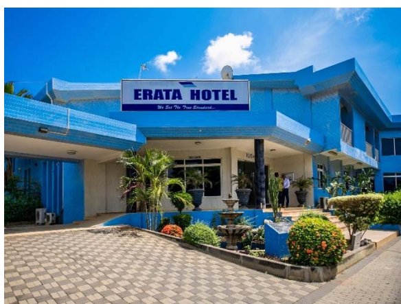
Front view of Erata Hotel, East Legon