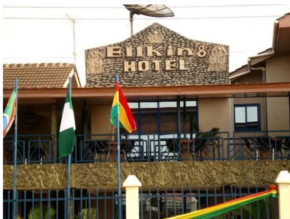
Front view of Ellking Hotel, Legon