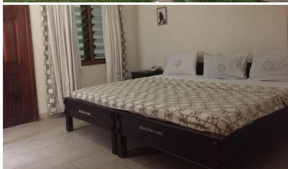
Front view of Yiri Lodge, Legon