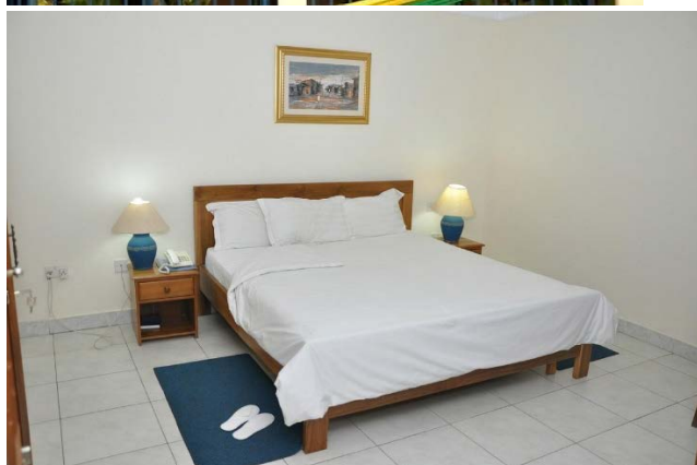
Single Room - Ellking Hotel, Legon