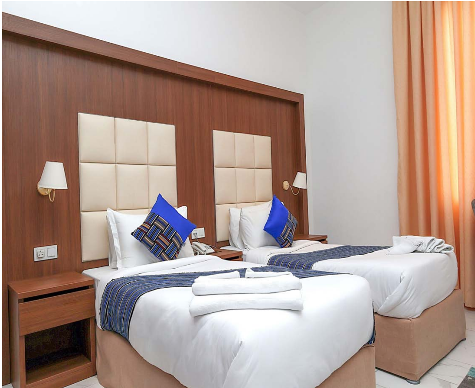
San Mario Hotel, Oxford Street Standard Room - San Mario Hotel, Oxford Street