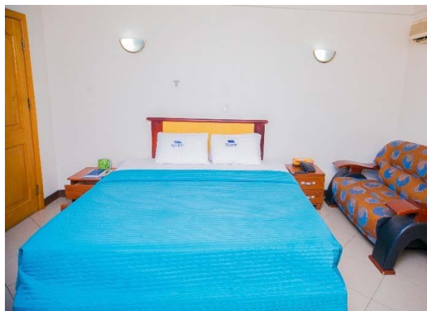
Single Room - Erata Hotel, East Legon