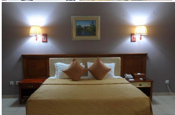
Front view of Mensvic Grand Hotel, East Legon Hotel, East Legon Hotel)